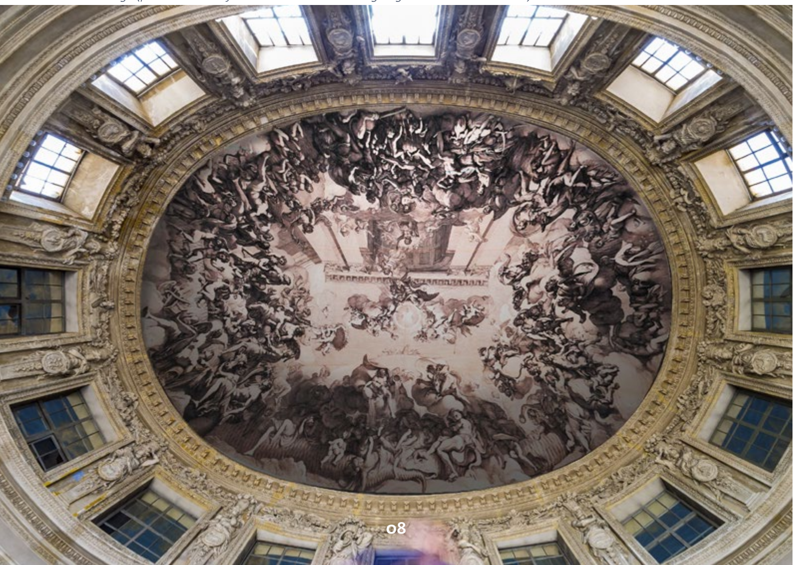
Photo montage (photo credit Alejandro Fernandez - montage Agence RL&A. Architectes)

Today, the Grand Salon is awaiting a major overhaul: the ceiling and plaster terminal figures urgently need thorough work, an intervention that will begin in autumn 2020.