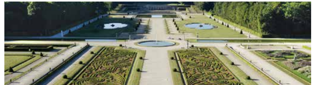
In 2019 starts a very ambitious program of restoration directed to the Le Nôtre gardens. More information will be disclosed soon.