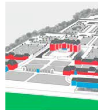
Upgrade and maintenance work projects including safety and video-surveillance infrastructures.