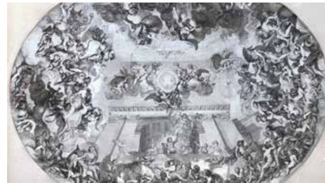
Digital reconstruction and projection of the Le Brun fresco .