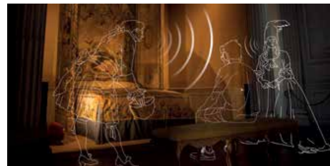
Creation of an immersive visit experience thanks to 3D sound technology.

For further information about these projects or the General Operating Fund please contact: