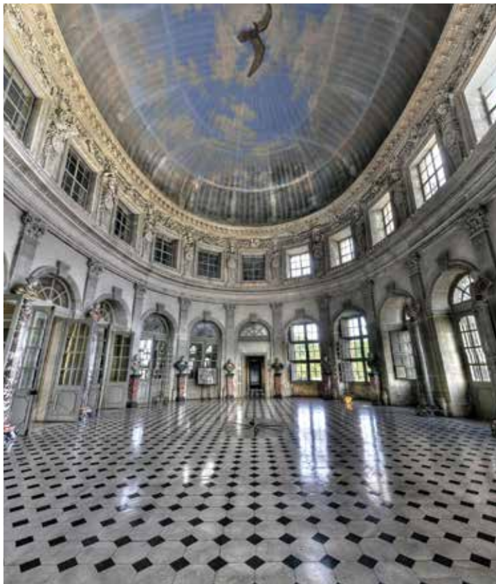
Restoration of the Grand Salon (Cupola, sculptures).